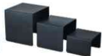
TABLE TOP STANDS

MATERIALS: WOOD, ACRYLIC, STEEL, FLUTE BOARD, CORRUGATED BOARD